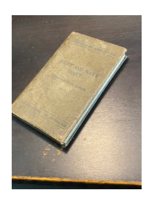
4-29-18 Drafted into the Army at 2:00 P.M. At Saginaw W.S.