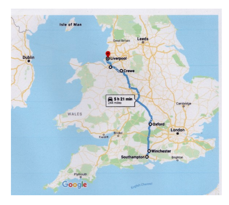
Sunday 8-4 Detrained about 3:00 A.M. at Winchester and went out about 2 mi to rest camp. Spent day here. Beautiful hills here. Down town in eve. but a holiday, everything closed.